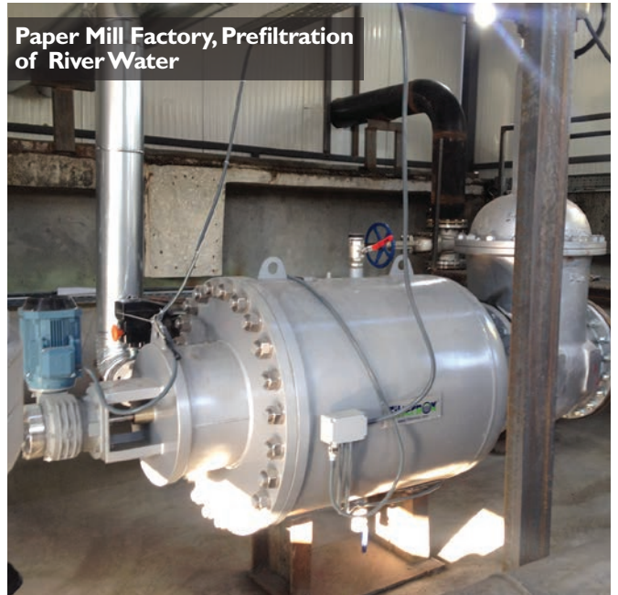
Paper Mill Factory, Prefiltration of River Water