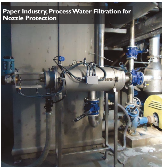
Paper Industry, Process Water Filtration for Nozzle Protection