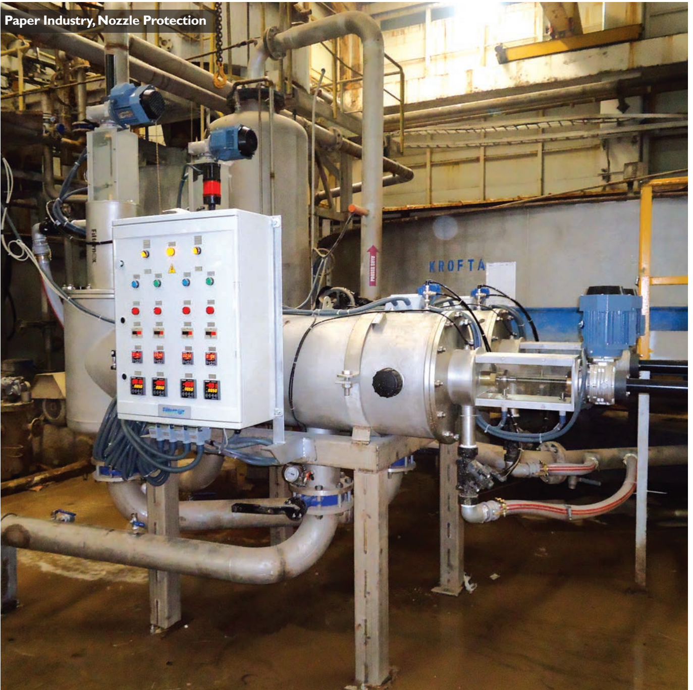
Paper Industry, Nozzle Protection