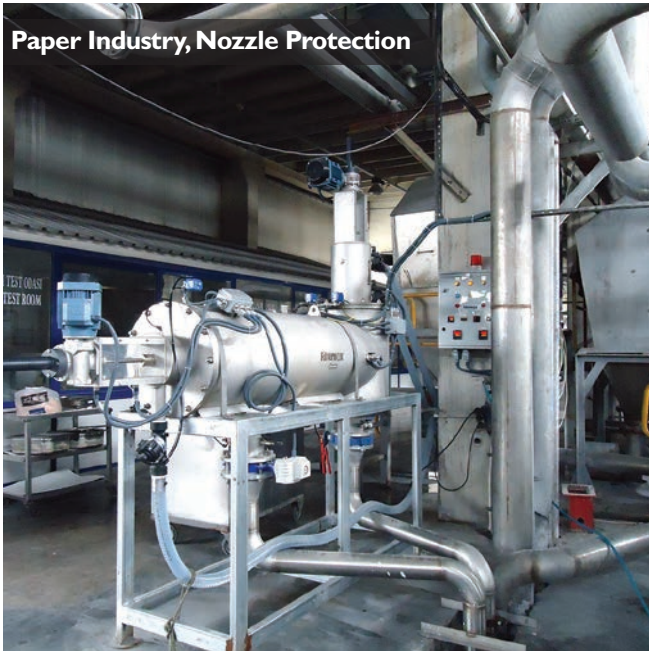
Paper Industry, Nozzle Protection