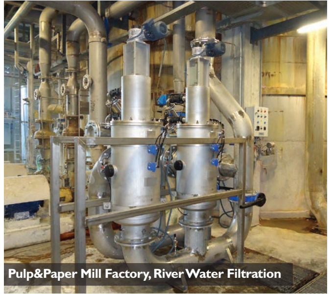
Pulp & Paper Mill Factory, River Water Filtration