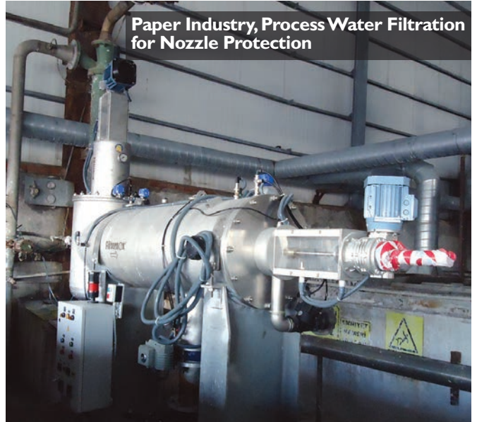
Paper Industry, Process Water Filtration for Nozzle Protection