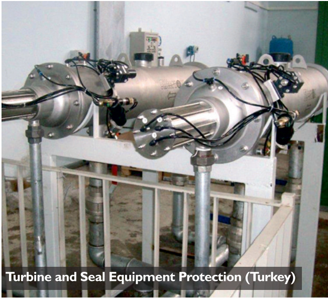
Turbine and Seal Equipment Protection (Turkey)