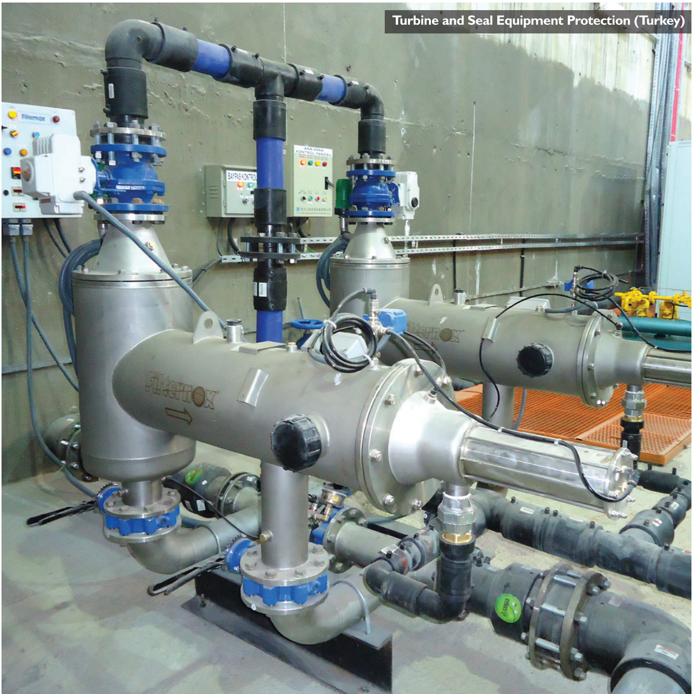
Turbine and Seal Equipment Protection (Turkey)