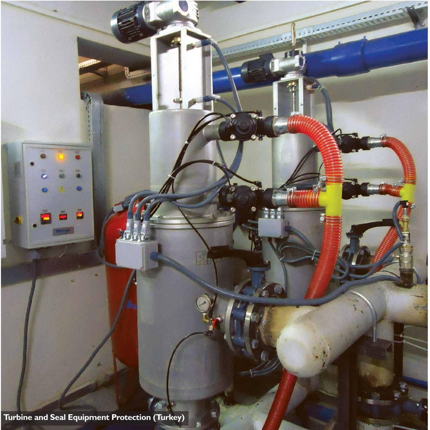
Turbine and Seal Equipment Protection (Turkey)