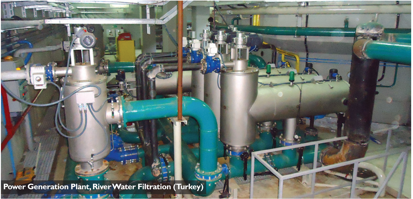
Power Generation Plant, River Water Filtration (Turkey)