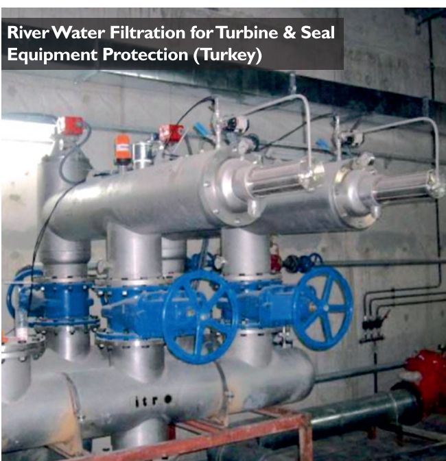
River Water Filtration for Turbine & Seal Equipment Protection (Turkey)