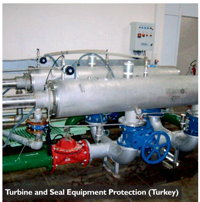
Turbine and Seal Equipment Protection (Turkey)