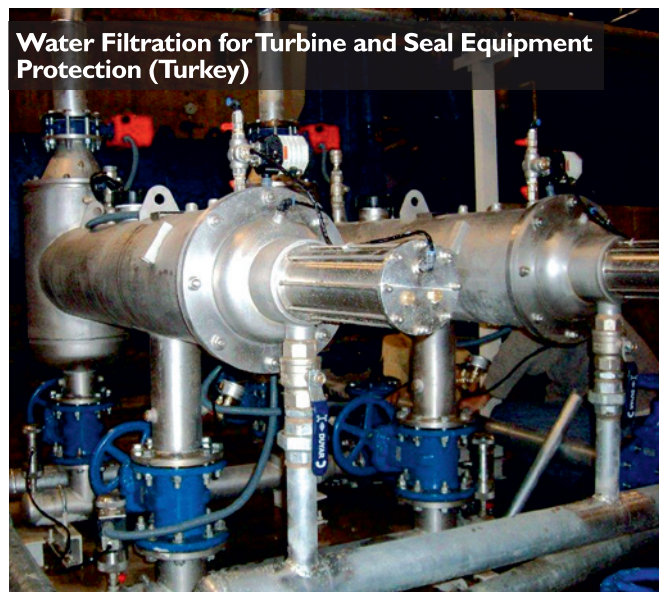
Water Filtration for Turbine and Seal Equipment Protection (Turkey)