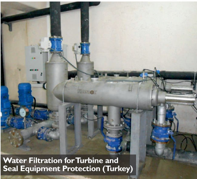
Water Filtration for Turbine and Seal Equipment Protection (Turkey)