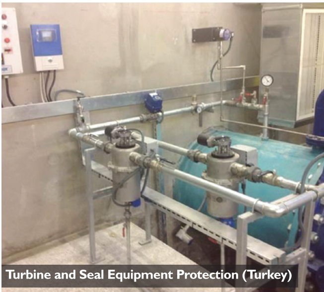
Turbine and Seal Equipment Protection (Turkey)