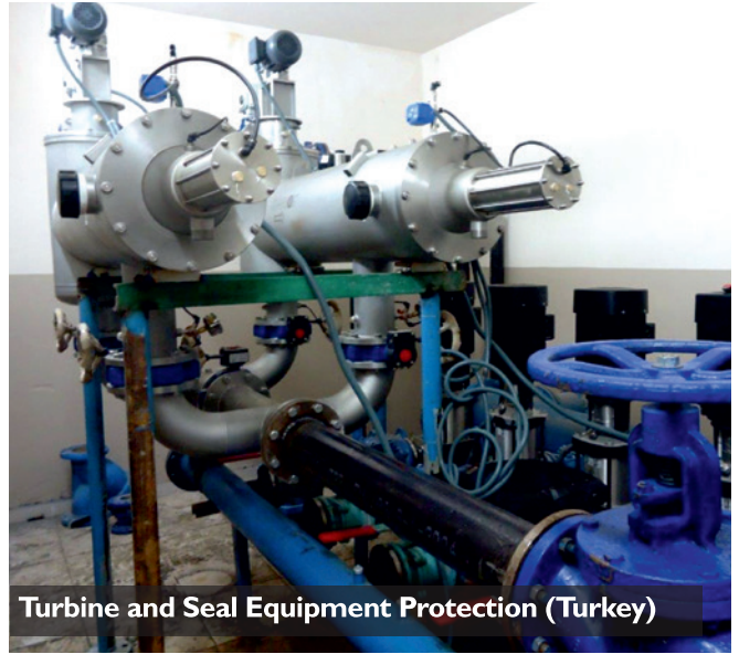
Turbine and Seal Equipment Protection (Turkey)