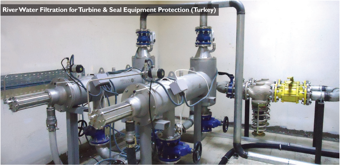
River Water Filtration for Turbine & Seal Equipment Protection (Turkey)