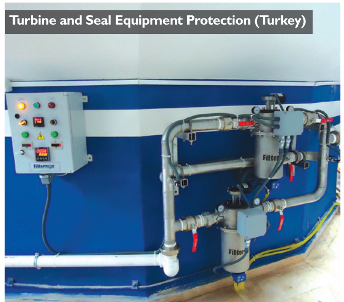
Turbine and Seal Equipment Protection (Turkey)