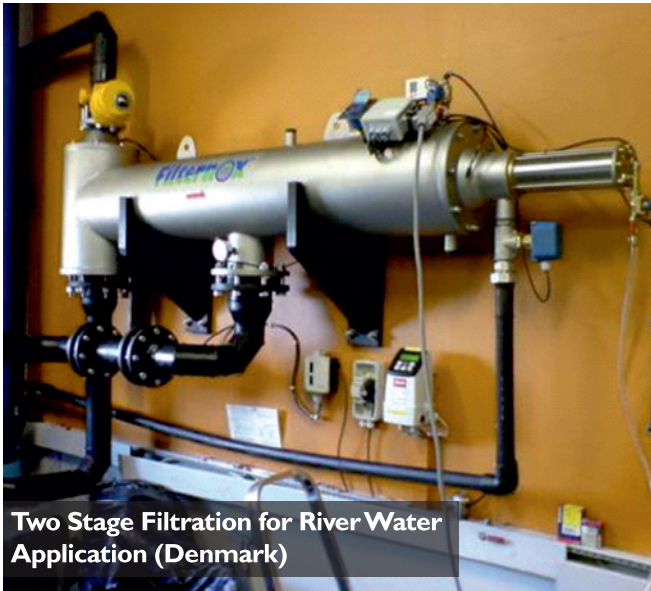
Two Stage Filtration for River Water Application (Denmark)