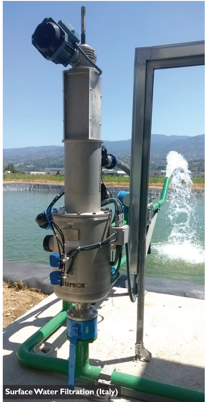
Surface Water Filtration (Italy)