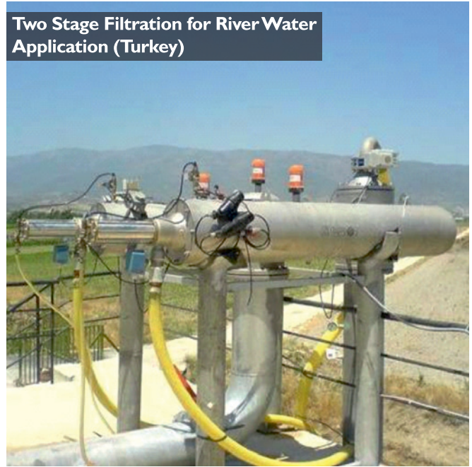
Two Stage Filtration for River Water Application (Turkey)