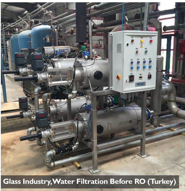
Glass Industry, Water Filtration Before RO (Turkey)